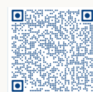
iBreviary for Apple