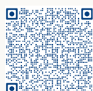
Laudate for Apple