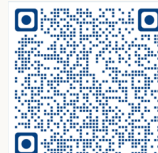
iBreviary for Android