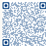
Laudate for Android