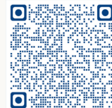
iBreviary for Android