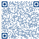
Laudate for Android