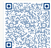
iBreviary for Apple