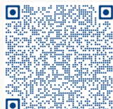
Laudate for Android