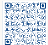
iBreviary for Android