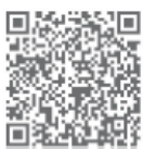
Scan to schedule an appointment.